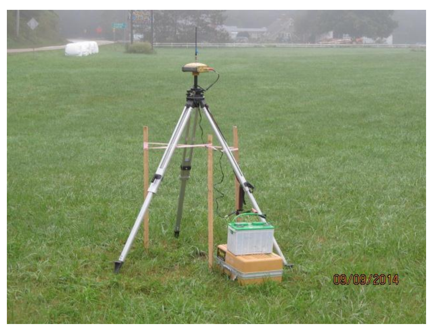
Figure 11. Photo. GPS base station set up over control point.

In addition to the GPS rover and base station, the project involved the use of a grader equipped with a GPS rover to enable complete automation of the cutting blade. The use of the GPS-enabled grader allowed fine and quicker grading operation at most times; however, there was some backtracking at times because of loss of GPS signal in some locations. The loss of GPS signal was primarily due the curvy road in the narrow steep valley.