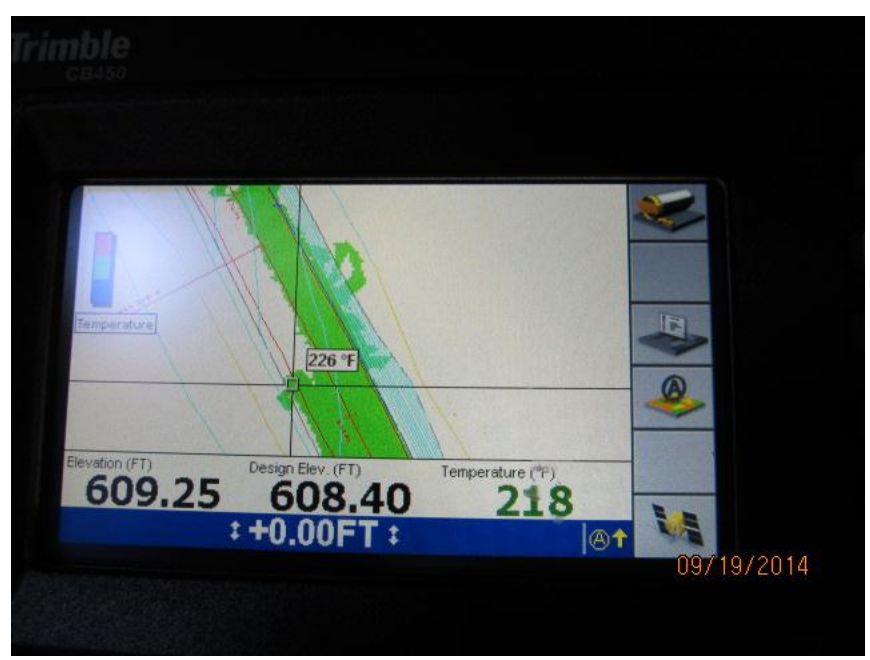
Figure 3. Photo. Temperature map from on-board IC data collector.