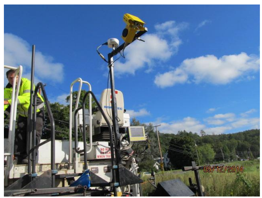
Figure 6. Photo. Infrared thermal scanner attached to rear of paver with interface controller mounted below.

The thermal scanner provided data on the recording paver speed, paver location, stoppage times and locations, date, time stamp, and project information as well (see figures 8 and 9 for interface controller). The data are stored automatically by the interface controller and can be imported and reviewed in MOBA's software, called Pave Project Manager.