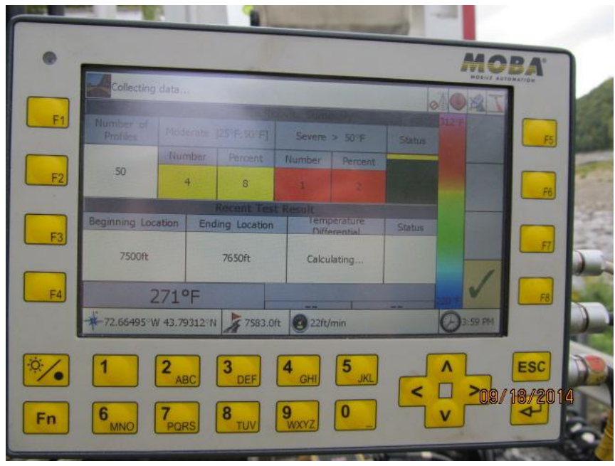
Figure 9. Photo. Interface controller monitor showing number and percentage of moderate and severe thermal profiles in yellow and red boxes.