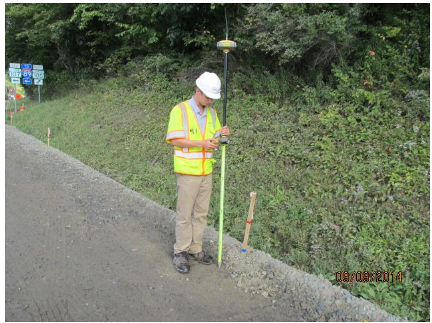
Figure 10. Photo. GPS rover and data collector used to check cut/fill levels for subbase.