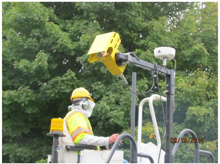
Figure 7. Photo. Infrared thermal scanner attached to rear of paver with GPS receiver behind it.