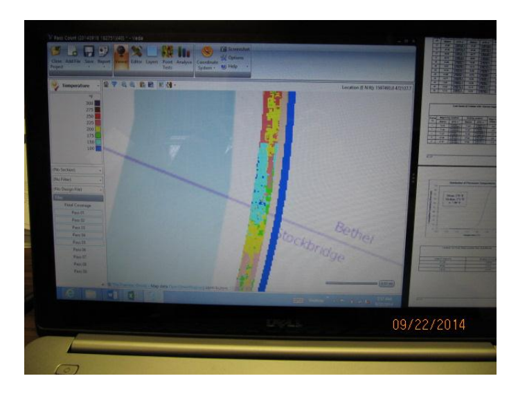
Figure 1. Photo. Example screen showing the CMV map.

The contractor was required to install IC technology on a dirt roller to be used for the two reclaimed stabilized base passes. The IC technology was installed on a double drum vibratory paving roller to measure the interactions between the roller and the compacted materials beneath. The Compaction Measurement Value (ICMV or CMV) was the real-time rating used to analyze the applied compaction effort, and it represented the stiffness of the materials based off the vibration from the roller drums and the resulting response that is returned from the underlying materials. Two temperature sensors, one mounted on the front of the roller and one mounted on the back of the roller, were used with the IC technology. The CMV, frequency, amplitude, pass count, roller speed, and temperature data were recorded continuously (see figure 1) enabling the engineer to review the daily work-related data and identify any areas for quality improvement.