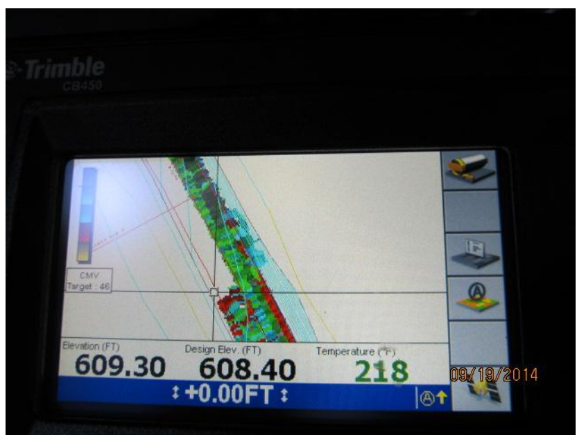
Figure 4. Photo. CMV data screen from on-board data collector.