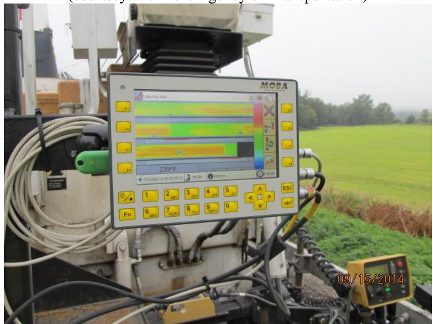
Figure 8. Photo. Interface controller attached to the rear of the paver for real-time monitoring. (courtesy: Vermont Agency of Transportation)

Figure 7. Photo. Infrared thermal scanner attached to rear of paver with GPS receiver behind it. (courtesy: Vermont Agency of Transportation)