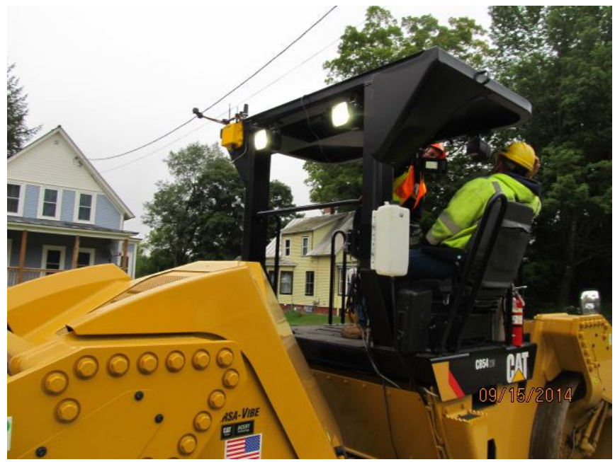
Figure 2. Photo. Paving roller mounted with IC equipment.