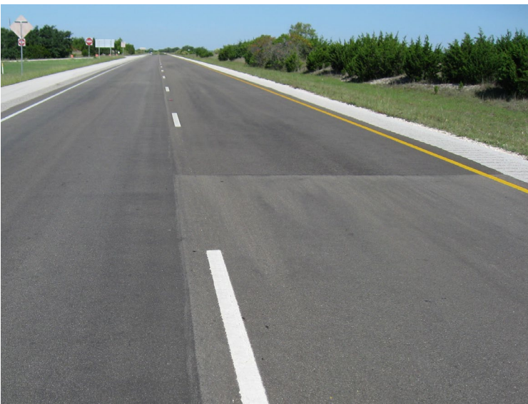
Advanced, proven preservation practices can help extend the overall service life of pavements.

Historically, pavement preservation programs have focused on applying specific project treatments at specific locations. These projects demonstrated that the proper application of a treatment could extend the life of a pavement at a relatively low cost. However, not all projects were successful due to poor timing, inappropriate treatments, substandard materials, and inexperienced construction crews. As a result, the policy in many agencies today is to allow pavements to deteriorate until reconstruction is the only option, resulting in higher costs and more pavements in poor condition.