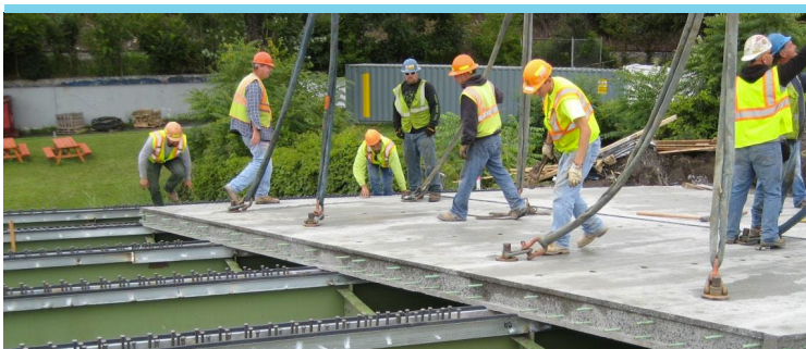
UHPC connection details make using prefabricated bridge elements simpler and more effective for accelerated bridge construction.

The third round of Every Day Counts (EDC-3) focused on demonstrating the advantages UHPC offers as an option for connecting prefabricated bridge elements, and this effort is continuing under EDC-4. The EDC implementation team is providing technical assistance and training, including peer exchanges, webinars, and workshops.