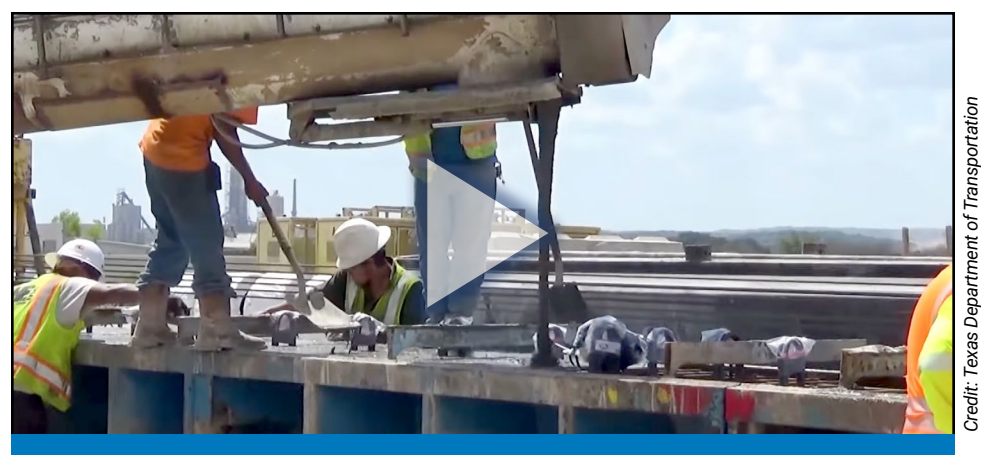
Texas is one of many State DOTs working to determine how best to use UHPC in their bridge inventory. Watch a <u>video</u> describing Texas' full-scale testing of UHPC girders.

A few years after the Mars Hill Bridge project, round one of FHWA's Every Day Counts program (EDC-1) kicked off with the inclusion of prefabricated bridge elements and systems (PBES) for accelerated bridge construction. Because PBES are connected onsite, they require high-quality, durable connections. FHWA added UHPC to EDC rounds three and four as an innovation that could improve the strength, simplicity, and durability of PBES connections.