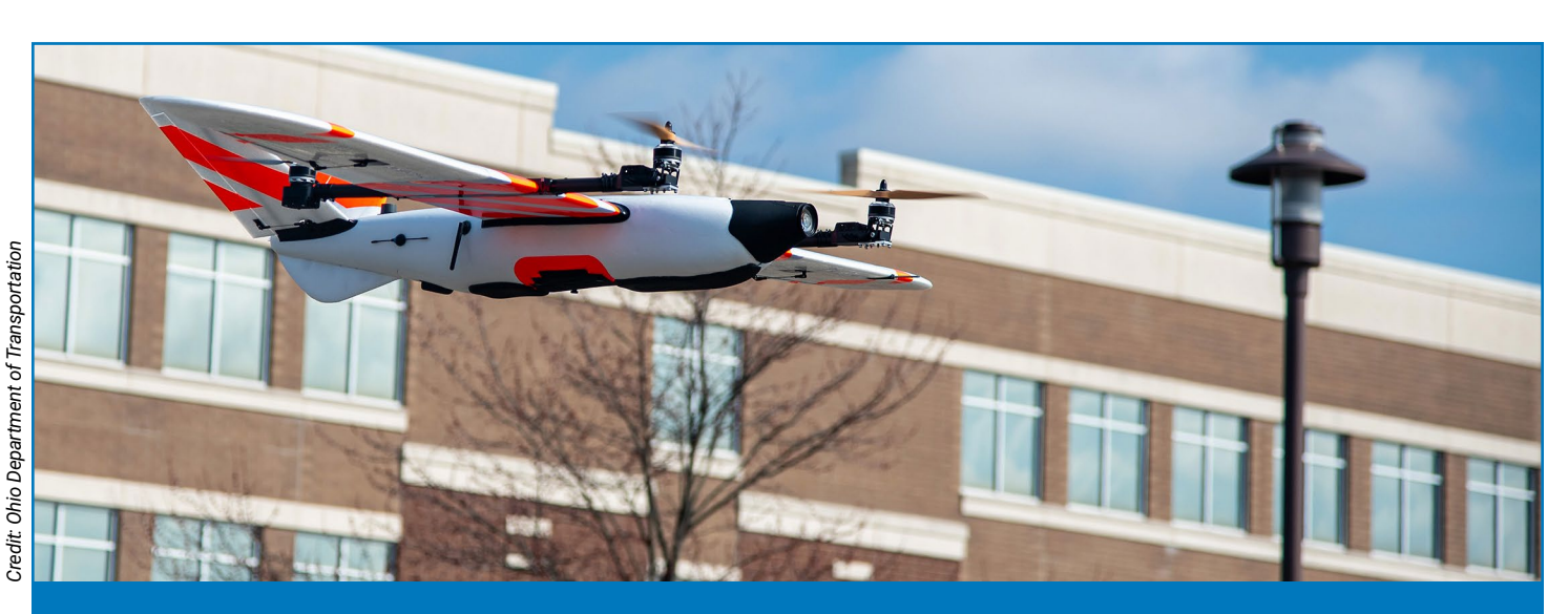
The Ohio DOT recently received approval from the Federal Aviation Administration to fly a large unmanned aerial system over a portion of highway near Columbus.

The Tennessee Department of Transportation (TDOT) hosted a virtual public engagement event during April to introduce a Planning and Environmental Linkages (PEL) Study on its Downtown Nashville Interstate Corridors project. TDOT is using the collaborative PEL approach to determine strategies for relieving congestion on the interstate network leading into and surrounding downtown Nashville. Due to the size and diversity of the corridor, the agency kicked off