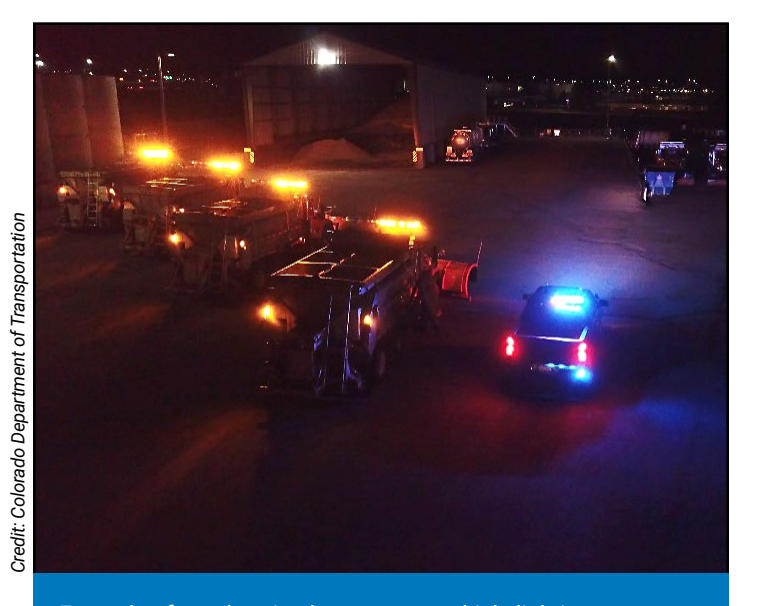
Example of synchronized emergency vehicle lighting.

Increasingly, traffic incident responders are looking for ways to communicate with approaching drivers while not blinding or distracting them. As part of Every Day Counts round 7 (EDC-7), the Next-Generation Traffic Incident Management (TIM) team is promoting a "SMART" approach to emergency vehicle lighting that can better inform roadway users, improve their ability to see roadside responders, and help them navigate around responders safely.