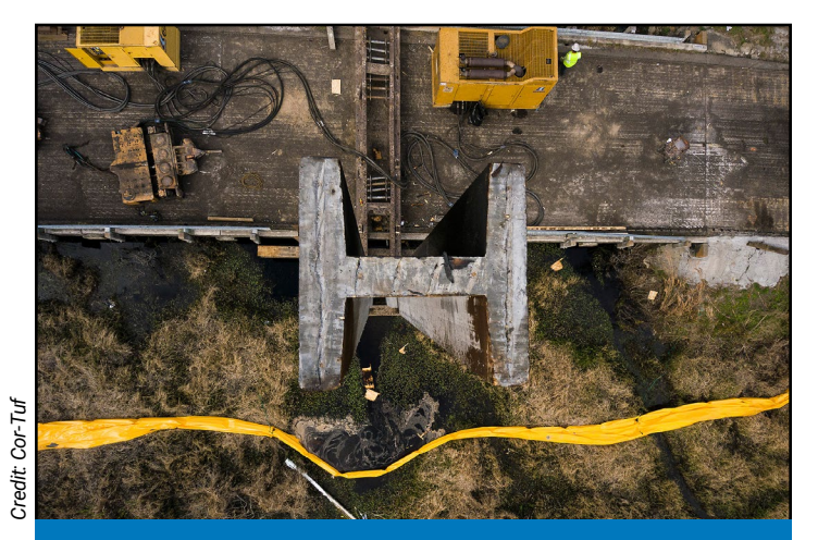
The Florida DOT's County Road 339 Waccasassa River Pile Demonstration in 2020 was the first use of a <u>UHPC prestressed H-pile</u> on a bridge in the State.

In 2003 the Federal Highway Administration (FHWA) began working with States to consider UHPC deployment, which was developed in Europe in the 1990s. Since then, more than 400 bridges across the United States have incorporated UHPC, mostly for field-cast connections between prefabricated components or for preservation and repair. These successful early deployments led to a growing interest in broadening the use of UHPC to a new application—construction of the bridge's primary structural components.