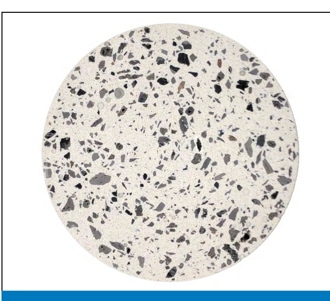
The dark aggregates in this cross section of a standard 4-inch-diameter cylinder are fine lightweight aggregates that are typically used for internally curing any concrete mixture.

Internal curing hides water inside a manufactured aggregate that expands with heat and creates extra porosity. This aggregate often has to be shipped, so in new applications there is an