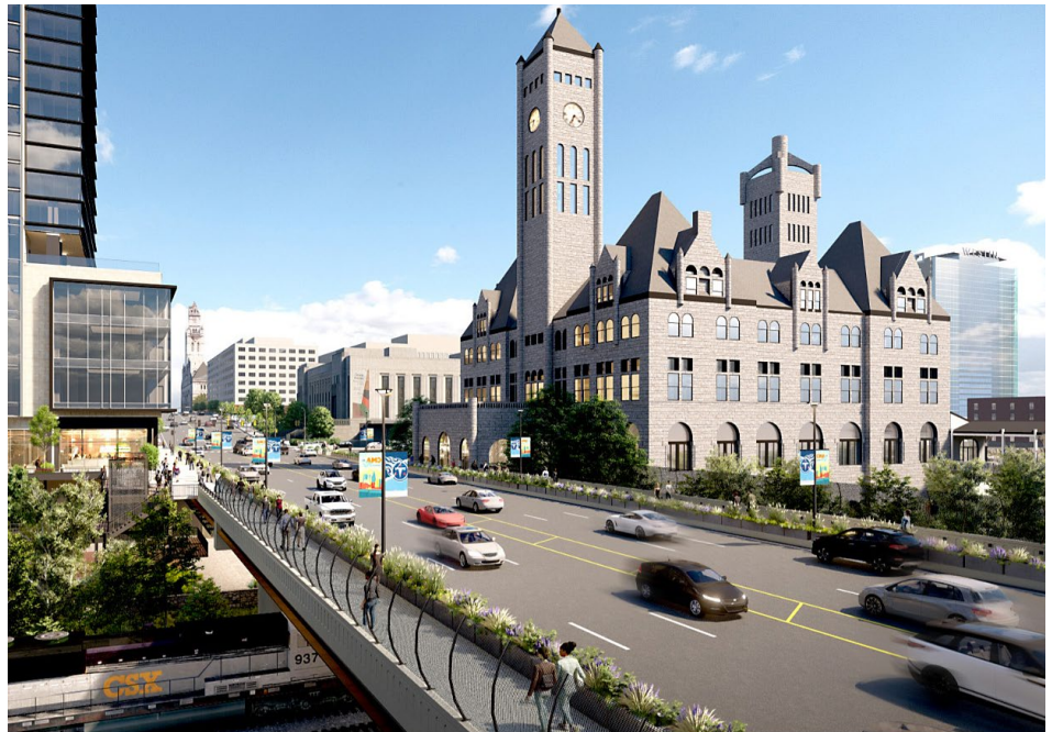
The Tennessee DOT combined accelerated bridge construction techniques with alternative delivery methods to replace a railroad viaduct in Nashville.

The Tennessee Department of Transportation (TDOT) used the construction manager/general contractor (CM/GC) delivery method to replace an aging bridge along a heavily traveled corridor in downtown Nashville. The State Route 1 (US 70) Broadway Viaduct , built in 1948, was in close proximity to historic sites and crossed over several active CSX railway lines. TDOT reported that it used CM/GC delivery, which allows a project owner to engage a construction manager during the design process to provide constructability input, and prefabricated bridge elements and systems to shorten the project length to 1 year rather than the standard 3 to 4 years a project of this magnitude would traditionally require.