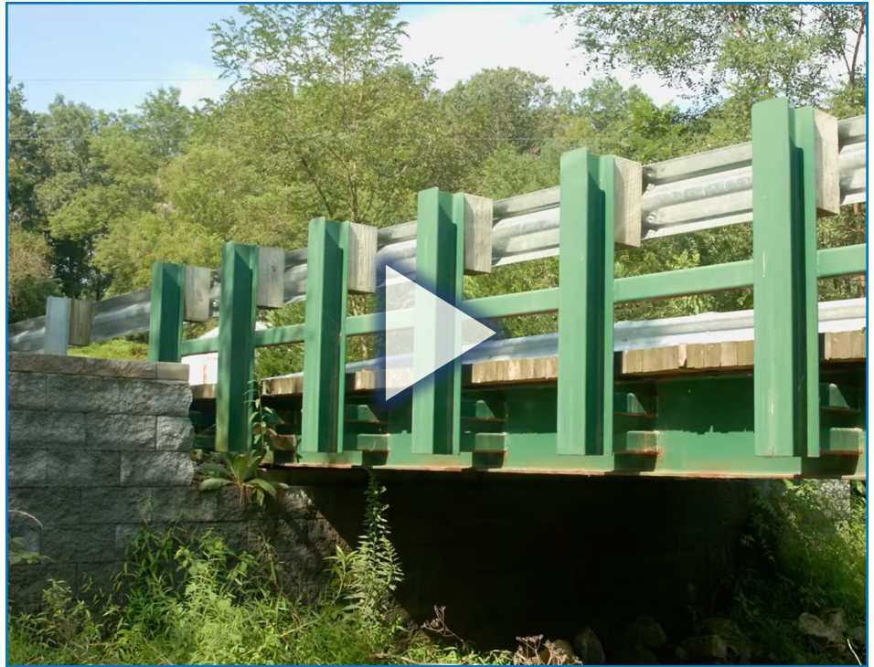
Pennsylvania's STIC created a video highlighting its use of STIC Incentive funds to deploy the Geosynthetic Reinforced Soil-Integrated Bridge System .

The Virginia Transportation Research Council (VTRC) applied STIC Incentive funds toward a wildlife fencing project that is improving safety by substantially lowering the number of deer-vehicle collisions along a busy interstate corridor. The first year after installation, VTRC recorded a 90-percent reduction in deer-vehicle collisions. After 2 years, VTRC reported the cost savings of fencing averaged over $2.3 million per site.