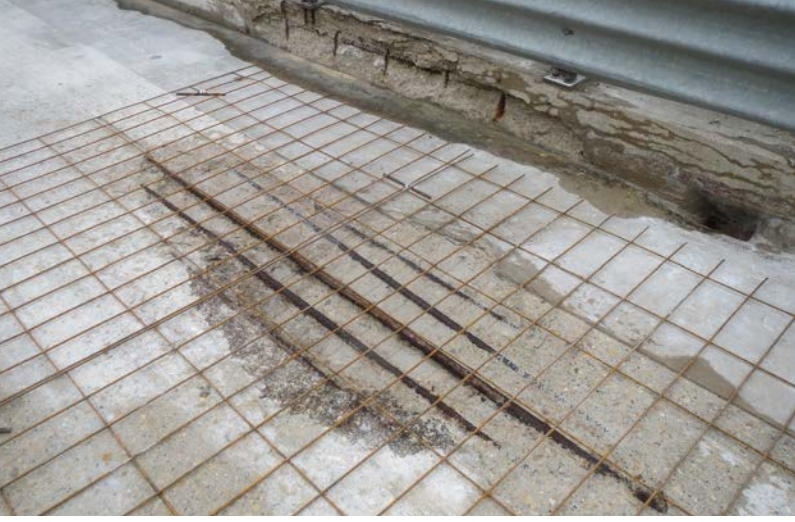
Before the bridge deck was rehabilitated, potholes exposed the deck's top reinforcement.

but shorter development lengths of reinforcing steel are used. That allows simpler reinforcing steel details and smaller areas for the connections. With shorter development lengths, less steel is needed in the connection. Large amounts of steel in the connection area can interfere with prefabricated member placement and placement of concrete in the connection.