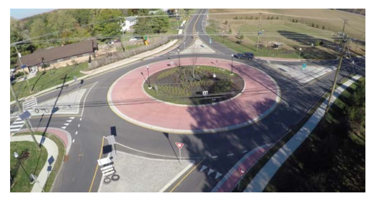
Predictive analysis tools helped the New Jersey Department of Transportation, Delaware Valley Regional Planning Commission and Burlington County decide to build a roundabout at a rural intersection.

Burlington County Engineer's Office. "The one that's completed has reduced the number of accidents to zero since the day it opened."