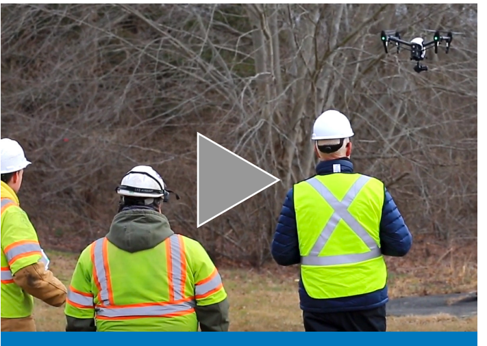
View a video on how the New Jersey Department of Transportation deploys UAS to increase safety and accuracy, accelerate data collection, and provide access to challenging locations.

To encourage deployment, the EDC-5 team is organizing workshops for State transportation departments that feature experts on UAS