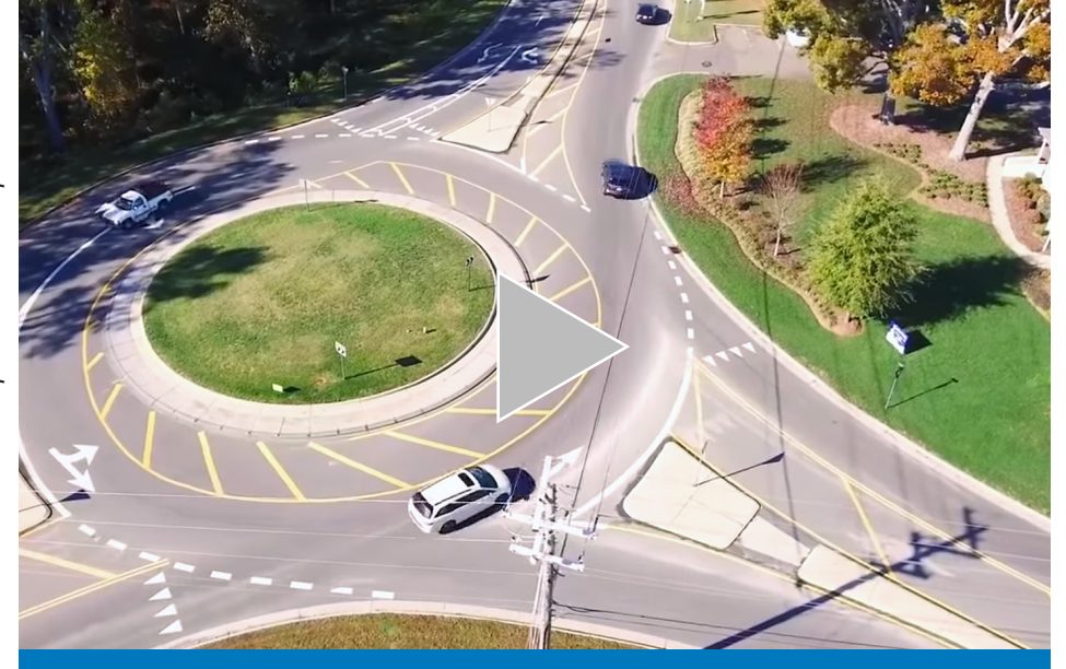
The North Carolina Department of Transportation used UAS to create a video to educate the public about the benefits of roundabouts.