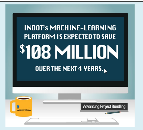
Figure 3. INDOT machine-learning results

In this approach, the first step in developing the cost model input data requirements for each category of bundled work type is to determine those pay items where approximately 80 percent of the cost resides and create a list of items, quantities, and unit prices. If desired, the agency can use a multiplier to mark up the rough order of magnitude estimate to account for the minor items that constitute the remaining 20 percent of the cost. This process will filter out projects not having common high value pay items.