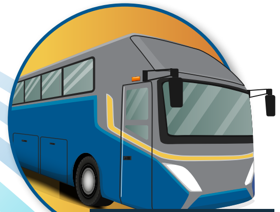
▲ OTRB bus with elevated passenger deck located over baggage compartment

► Only Federal-aid toll facilities subject to 23 U.S.C. 129 (general tolling program) or 23 U.S.C. 166 (high occupancy vehicle lanes) must provide equal access to OTRBs. Visit FHWA's website to learn about toll facilities affected.