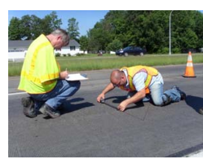
Researchers record initial lengths between pins for expansion measurements.

In order to properly monitor the pavement after treatment, selected panels throughout the section were instrumented with stainless steel pin gages for expansion measurements, and also labeled for crack mapping measurements. In