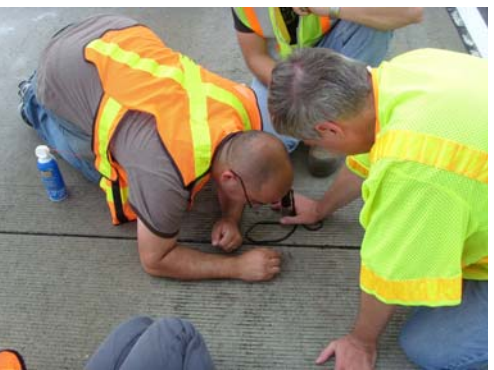
Expansion measurements conducted day after first treatment.

The research team, along with DeIDOT, will continue to monitor the pavement during the course of the project. The data from future monitoring trips