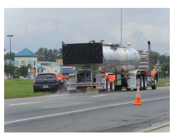
Left lane of highway sprayed by lithium truck (application rate set at 1.5 gal/1000 ft<sup>2</sup>)

Procession of lithium treatment: Water truck (front) followed by lithium truck. Final water truck (not shown) followed the lithium truck to apply a final coat of water.