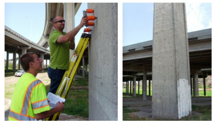
Figure 7. Conducting humidity measurements on a treated column (left); view of a column treated electrochemically with lithium nitrate (right).

Two sets of five columns each were selected for treatment under the Lithium Implementation Program. A total of eight columns (four columns from each set) were treated using the following methods: 1) electrochemical lithium treatment on mediablasted concrete surface; 2) vacuum treatment with lithium; 3) topical silane on media-blasted concrete surface; and 4) topical silane on painted concrete surface. Two columns, one from each set, were left untreated as controls. All treatments were completed in May 2006. The