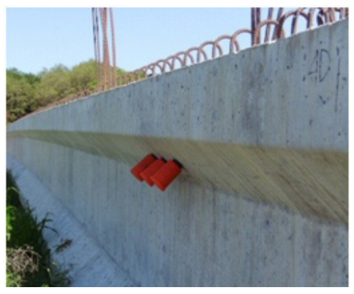
Figure 5. Humidity probes enclosed in plastic covers.

In December 2010, the girders were treated and instrumented with humidity sleeves and tubes for future internal humidity measurements. Since TxDOT had already instrumented the girders with steel pins for expansion measurements, no additional pins were drilled into the girders.