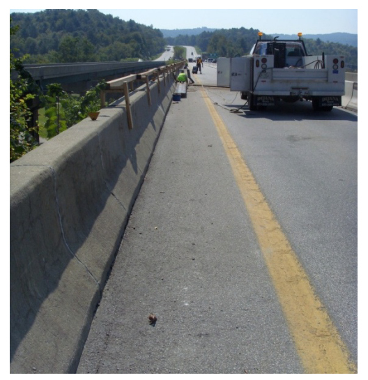
Figure 10. Overview of treatment site.

The treatment of the bridge walls was scheduled for May 2011. However, due to weather constraints and scheduling conflicts, only the northbound part of the bridge was treated. The remaining treatments are scheduled to be completed by the end of summer 2011.