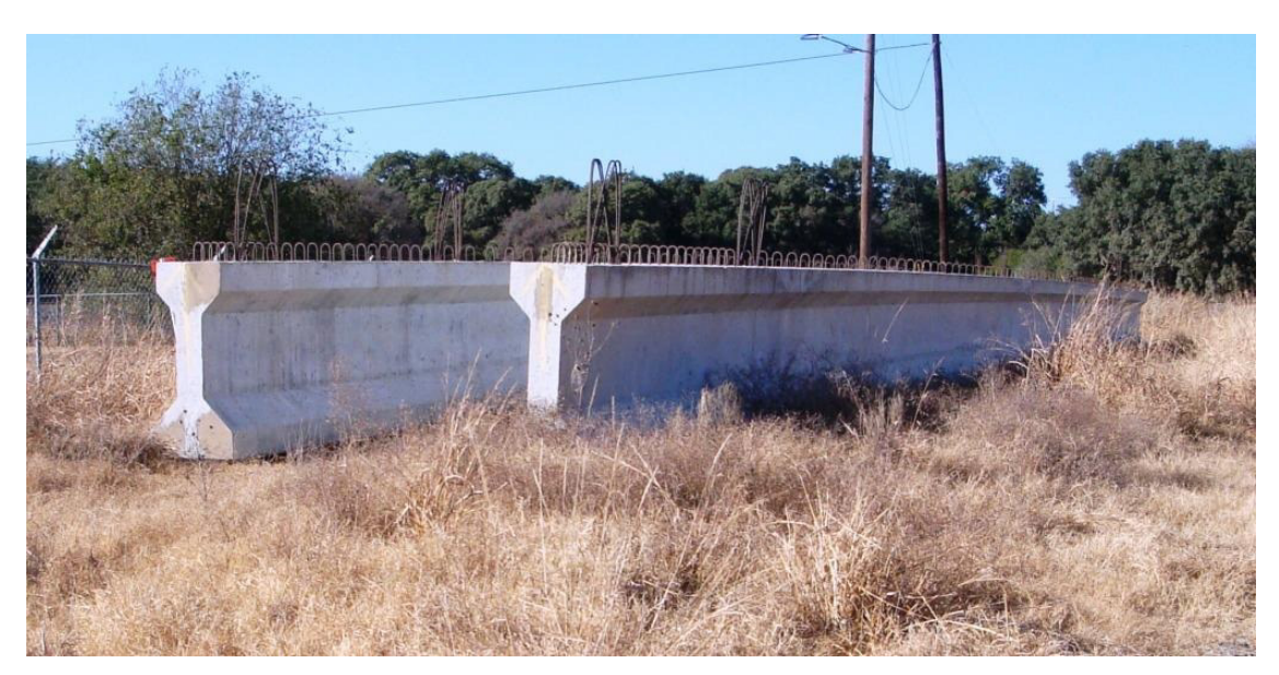
Figure 2. View of precast girders in New Braunfels, Texas, prior to treatment. Only two out of four girders are shown.

Four girders, located in New Braunfels, Texas, were set aside for treatment and evaluation. It was decided to treat half of each girder topically with silane, leaving the untreated half as a control.