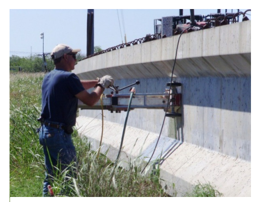
Figure 4. TxDOT worker extracting cores for further testing.

The first monitoring visit was conducted in April 2011, and expansion and humidity measurements were collected for all girders. Expansion measurements were collected using the FHWA comparator device, as well as TxDOT's comparator. In addition, the team requested additional cores be extracted from the control section for further petrographic testing.