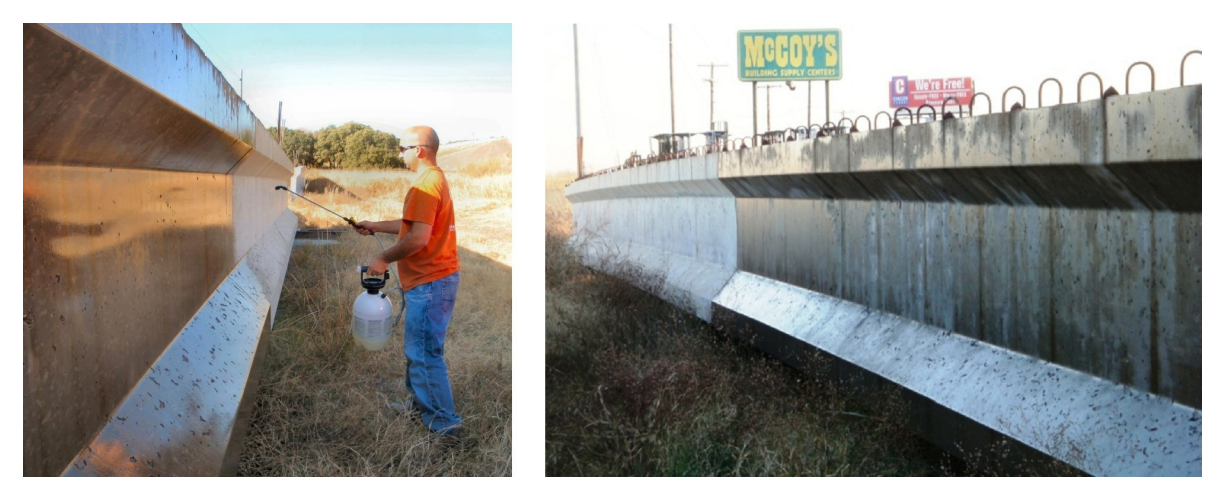
Figure 3. Topical application of silane using a handheld garden sprayer (left); view of girder after treatment (right). Only half of each girder was treated with silane.

In December 2010, the girders were treated and instrumented with humidity sleeves and tubes for future internal humidity measurements. Since TxDOT had already instrumented the girders with steel pins for expansion measurements, no additional pins were drilled into the girders.