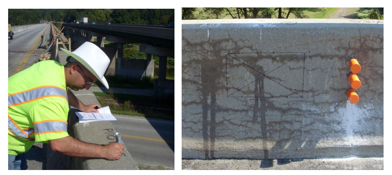
Figure 9. Worker labeling the treatment on the bridge wall (left); instrumentation site with crack mapping, expansion, and humidity sites for data collection (right).

instrumented in early August; however, the southbound section was instrumented later that month for expansion, crack mapping, and humidity measurements as well.