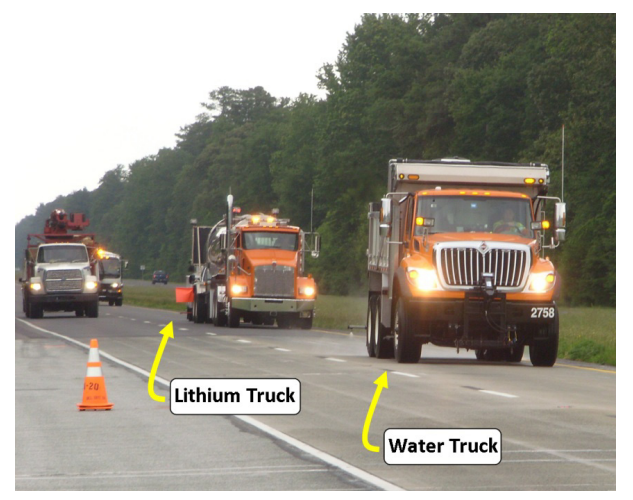
Figure 1. Treatment of concrete pavement in Georgetown, Delaware. Water application (first vehicle) followed by lithium application (second vehicle). Third vehicle with second pass of water not shown.

In May 2009, a section of pavement along State Route 113 in Georgetown, Delaware was evaluated as a candidate for treatment under the FHWA ASR Development and Deployment Program. After the results of a petrographic analysis confirmed ASR distress in the pavement, the test section, totaling 16 lane miles, was treated with a topical application of lithium nitrate. The objective of this field trial was to efficacy of using topical determine the applications of lithium nitrate in mitigating the ongoing ASR distress in the pavement. Sections of the pavement were instrumented for future monitoring activities to capture the efficacy of the treatment.