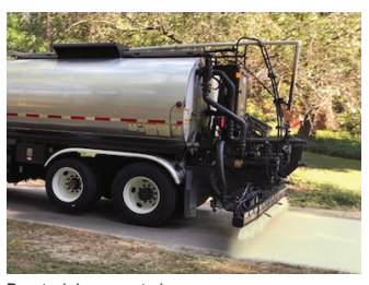
Pavetech Incorporated Figure 7. Rejuvenators