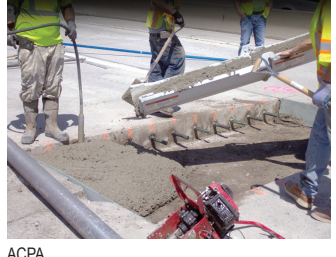
Figure 8. Full-depth repair