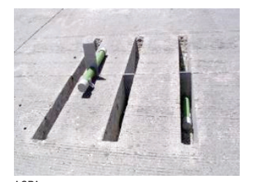
Figure 10. Dowel bar retrofit