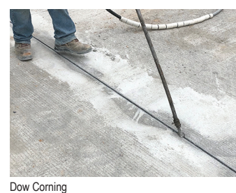
Figure 11. Joint sealing