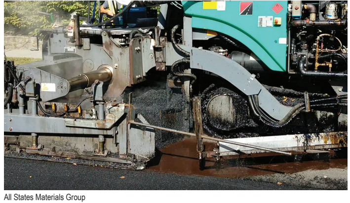
Figure 7. Ultrathin bonded wearing course