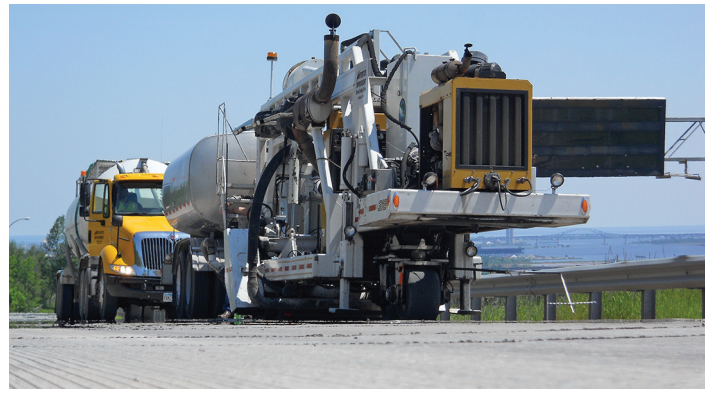
International Grooving and Grinding Association Figure 12. Diamond grinding