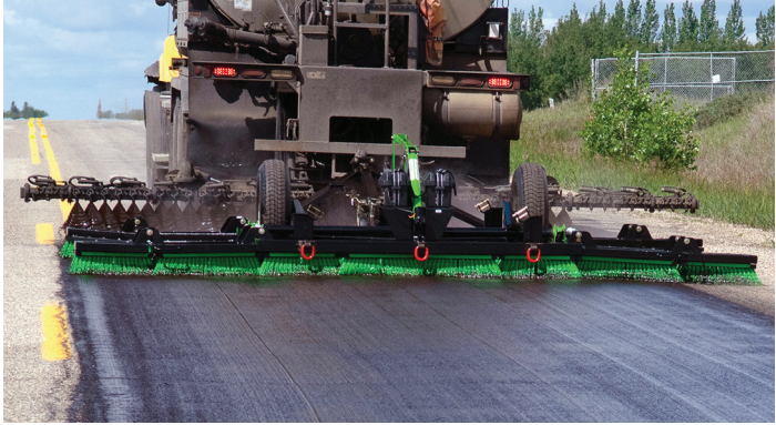
Saskatchewan Ministry of Highways and Infrastructure Figure 8. Scrub sealing