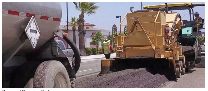
Pavement Recycling Systems Figure 4. Cold in-place recycling