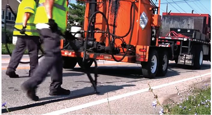
National Center for Pavement Preservation Figure 6. Crack sealing