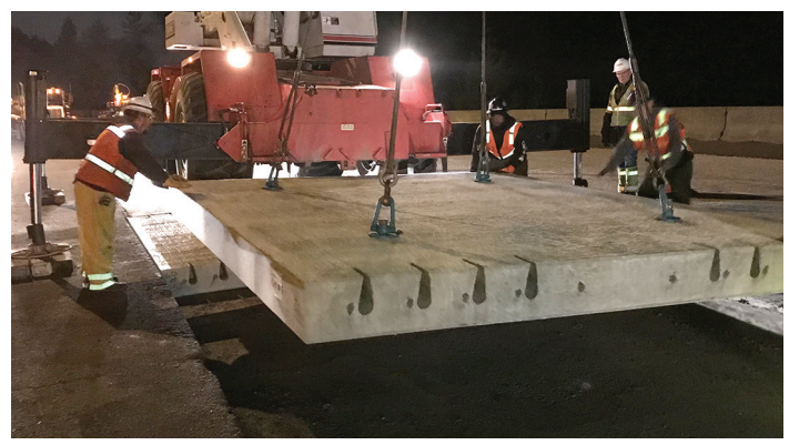
Shiraz Tayabji Figure 11. Precast slabs