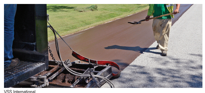
Figure 3. Slurry sealing