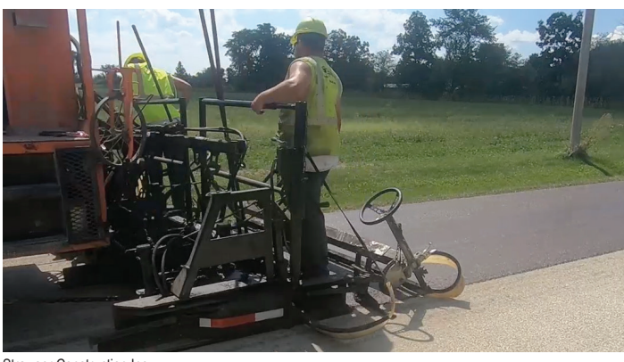
Strawser Construction Inc. Figure 9. Cape sealing