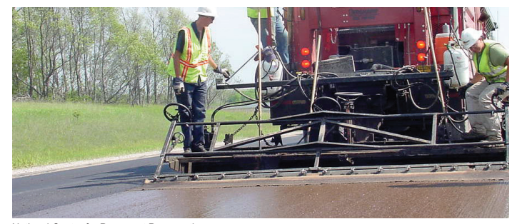
National Center for Pavement Preservation Figure 2. Micro surfacing