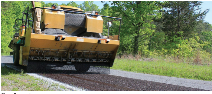
Slurry Pavers, Inc. Figure 1. Chip sealing

Eight asphalt and three concrete pavement preservation treatments were discussed in depth (see Figures 1–12). All four states use crack sealing, chip seals, and ultrathin bonded wearing courses as the predominant asphalt treatments. Diamond grinding is the predominant concrete treatment, but two states only use concrete as the final surface on a limited number of roads. The states differed among themselves and from the local agencies in terms of the desired treatment applications. Treatment application was not consistent in some cases. Proper project selection and construction quality were discussed as critical elements of successful treatments. Some treatments were recognized as more sensitive to construction practices than others, and this sensitivity has led to some of the moratoriums that have historically been imposed.