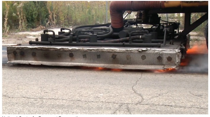
National Center for Pavement Preservation Figure 5. Hot in-place recycling