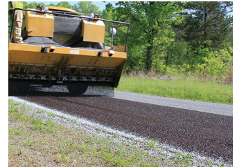
Slurry Pavers, Inc. Figure 4. Chip sealing