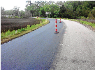
Charleston County, S.C. Figure 1. Asphalt rubber chip sealing

hot-mix asphalt industry and thereby lower preservation costs. Concrete preservation treatments are not used in these four states due to the lack of concrete pavements and repair expertise. The states did not think an additional use of concrete pavements would enhance competition with the asphalt industry.