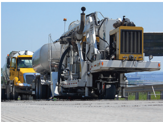
International Grooving and Grinding Association Figure 9. Diamond grinding