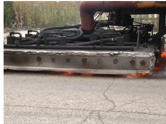
National Center for Pavement Preservation Figure 3. Hot in-place recycling