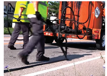
National Center for Pavement Preservation Figure 8. Crack sealing