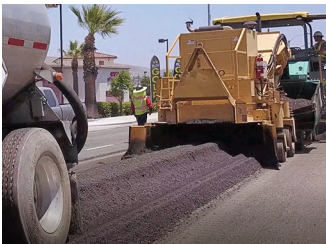
Pavement Recycling Systems Figure 5. Cold in-place recycling