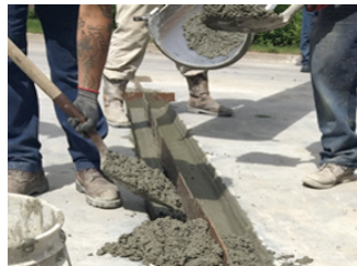
ACPA Figure 10. Partial-depth repair