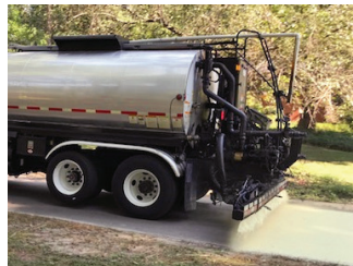
Pavetech Incorporated Figure 7. Surface spray rejuvenators