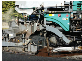
All States Materials Group Figure 6. Ultrathin bonded wearing course