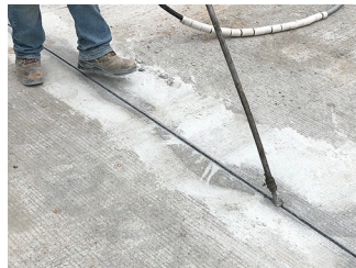
Dow Corning Figure 11. Joint sealing