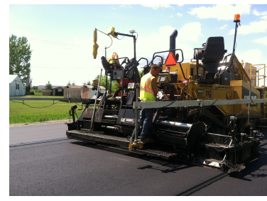
Above: A PMTP in use on a paver in Minnesota. Below: Sample of a thermal map.

PMTPs use temperature sensors to continuously read surface temperatures of the newly placed asphalt mat immediately behind the trailing edge of the paver screed during placement operations. These readings can indicate temperature differentials, usually referred to as thermal segregation. Data are converted to visual representations of the surface temperatures along a paver's path, often in the form of maps or charts.