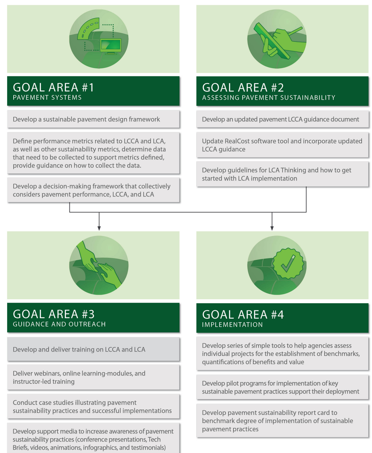
Figure 1-1. Road Map goal areas, proposed actions, and their interrelationships.

6 presents general concluding remarks, including a brief review of the goals, strategies, and key priorities identified in the Road Map and a discussion of the way forward. The document also includes one appendix (Appendix A) that provides a summary of the future needs that are either outside the scope of the Sustainable Pavements Program or fall under the longer-term time horizon.