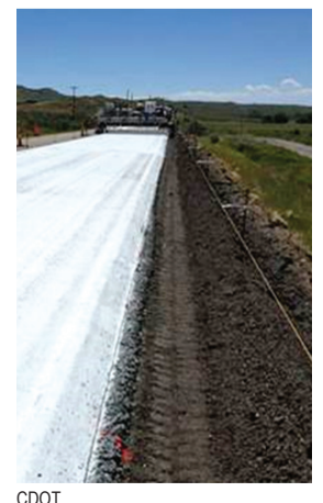
Figure 2. Asphalt millings placed on the shoulder

For the SH-13 project, the contractor opted to mill the existing asphalt pavement to maintain a consistent concrete overlay thickness. The existing roadway was surveyed to develop a milling plan, and areas identified as requiring deep cuts were cored to ensure that the remaining asphalt maintained the minimum thickness. After milling, a minimum depth of 7 inches of asphalt pavement remained. Asphalt millings were placed on the shoulder to create a stable track pad for the concrete paver (Figure 2).