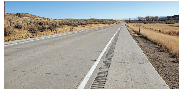
Figure 3. Completed concrete on asphalt–bonded overlay

As a final step, the contract specifications required the contractor to diamond grind the concrete surface to remove depressions or slope misalignments (not to exceed \frac{1}{8} inch in 12 feet). The completed overlay is shown in Figure 3.