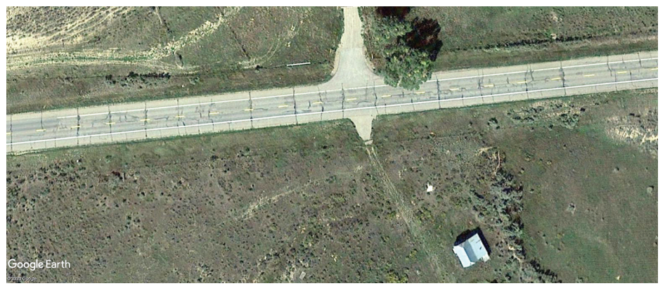
Figure 1. Existing asphalt pavement condition prior to concrete overlay

Bonded concrete overlays rely on the underlying pavement to provide support and load carrying capacity. For bonded concrete overlays of asphalt pavement, the strength and thickness of the concrete slab and the bond between the new concrete surface and the existing asphalt essentially establishes a monolithic pavement structure. This case study summarizes the design and performance of a 6- inch-thick, 131,000 square yard bonded concrete overlay project utilizing pilot car traffic control.