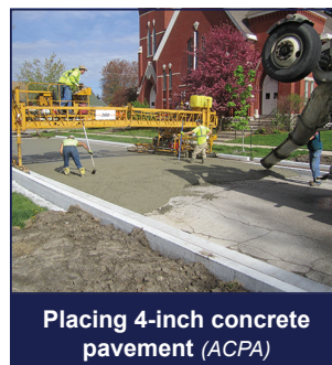
Placing 4-inch concrete pavement (ACPA)

East Carroll Street, a highly traveled one-way street through a residential neighborhood in Macomb, Illinois, is a common route to schools, stores, and restaurants. After years of maintenance, East Carroll Street was in need of serious rehabilitation or reconstruction. In 2013, to reduce costs and provide a sustainable solution , a bonded 4-inch composite concrete overlay system was selected for East Carroll Street as an alternative to removing and replacing the pavement. The street width was increased to 23 feet to provide for on-street parking and a bicycle lane. The existing surface was milled at a variable depth to adjust the profile and fix existing cross slopes where possible. The new pavement was structural fiber-reinforced concrete (4 pounds of fiber per cubic yard of concrete) with a 4-foot square saw cut pattern.