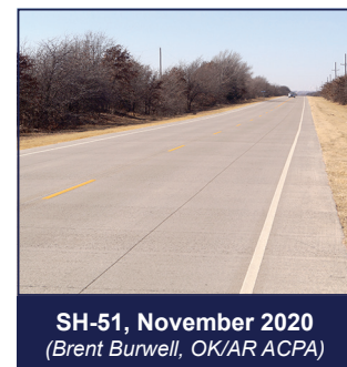
SH-51, November 2020