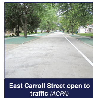
East Carroll Street open to traffic (ACPA)

Visit our website for more information on Targeted Overlay Pavement Solutions.