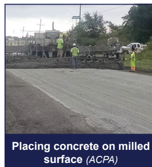
Placing concrete on milled surface (ACPA)

The final design for the SH-51 Blaine County project called for the placement of a 5-inch bonded concrete overlay with fiber mesh over an existing milled asphalt pavement. The contractor was able to use a trimmer capable of milling or trimming off at least 1 inch of asphalt over a width of 16 feet on a single pass, thus tightly controlling the product yield to a minimal percentage. The project was let and bid on, and contracts were awarded. Construction was completed in roughly 90 days.