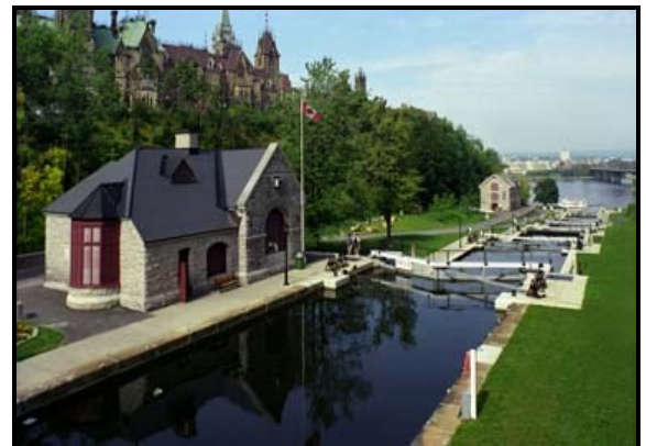
Rideau Canal, UNESCO World Heritage Site