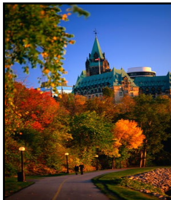
Parliament Hill in Autumn