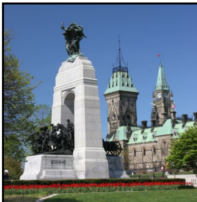
National War Memorial