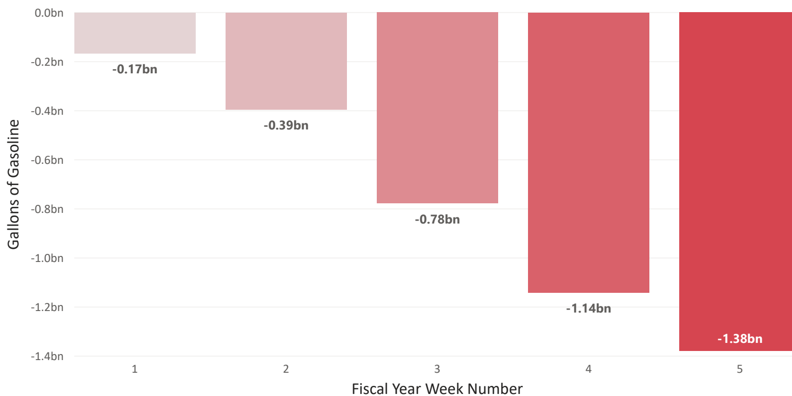
Weekly Gasoline Product Supplied Table