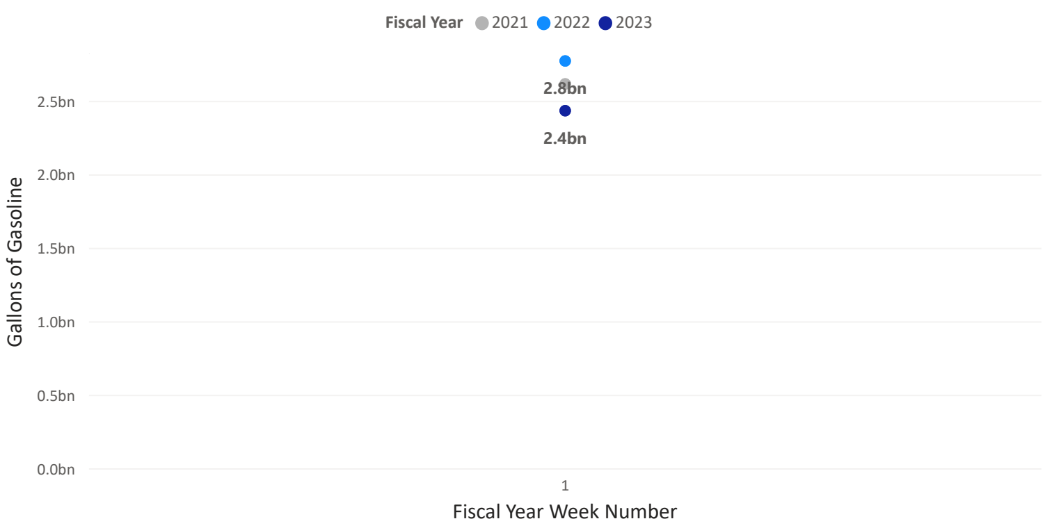
Weekly Gasoline Product Supplied

Gasoline product supplied compared to the same week in FY 2022 decreased by -12.21%, decreased by -6.97% for the same week in FY 2021, and decreased by -8.83% for the same week in FY 2019