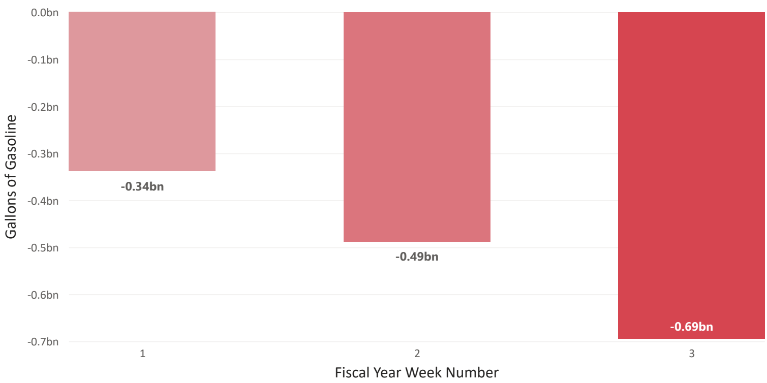
Weekly Gasoline Product Supplied Table