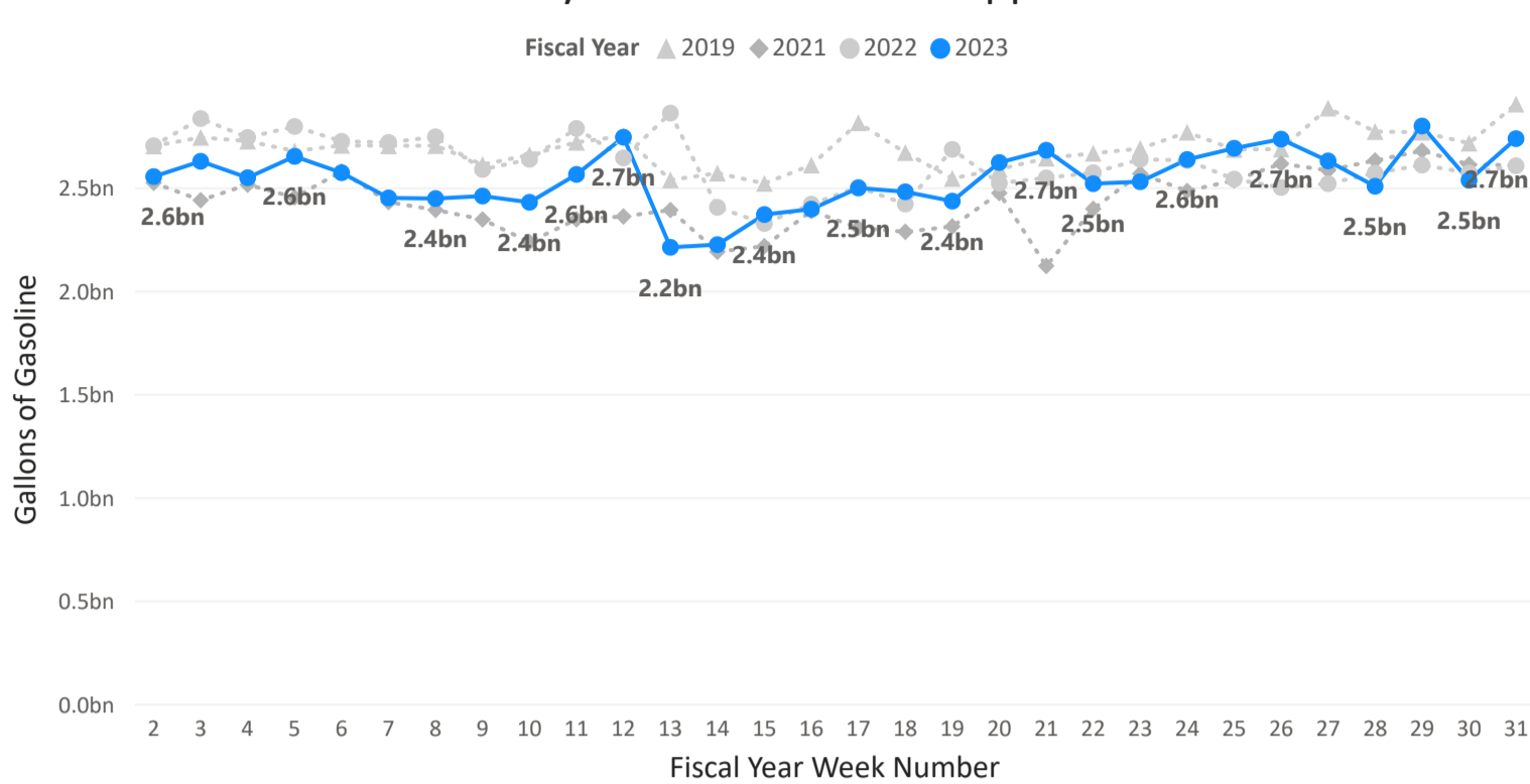
Weekly Gasoline Product Supplied

Gasoline product supplied compared to the same week in FY 2022 increased by 5.05%, increased by 4.95% for the same week in FY 2021, and decreased by -5.75% for the same week in FY 2019