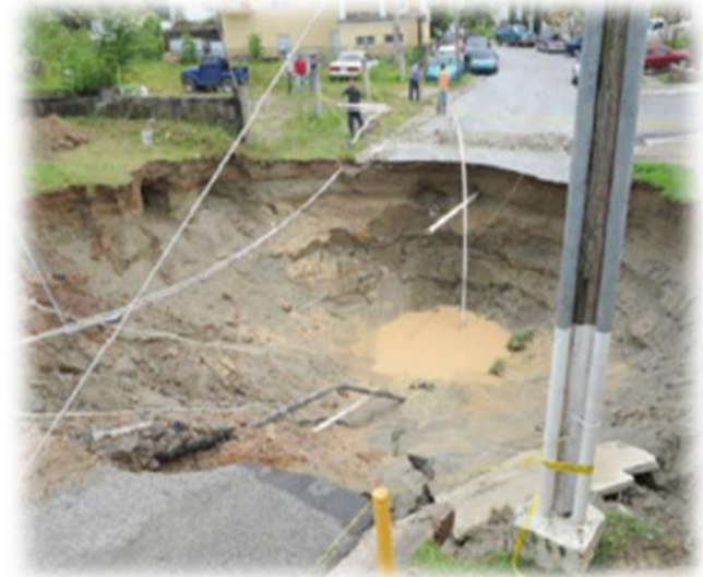
Permanent Repair Work