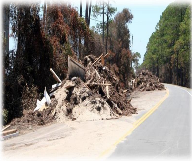
Emergency Repair Work