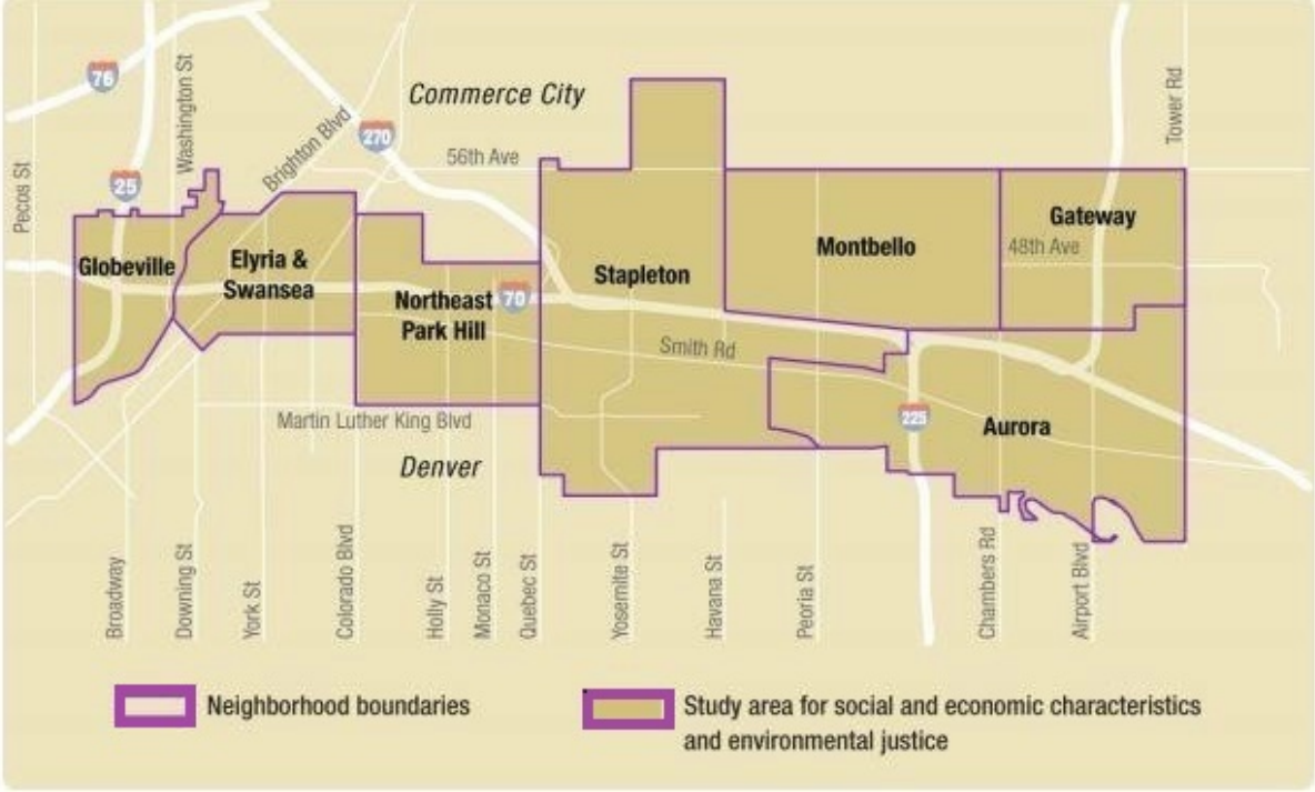
Exhibit 5.3 -1 - Environmental justice study area