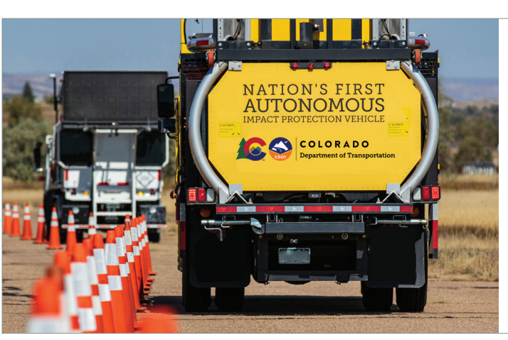
Colorado Department of Transportation tests the autonomous truck mounted attenuator in live work zones to evaluate the safety benefits of autonomous impact protection vehicles in road maintenance.

(Web page) National Cooperative Highway Research Program (NCHRP). Washington, D.C. Available online: https://pooledfund.org/Details/Study/632, last accessed January 6, 2021 <sup>2</sup>Transportation Pooled Fund Program. (2019). "Fostering Innovation in Pedestrian and Bicycle Transportation Pooled Fund Study." (Web page)