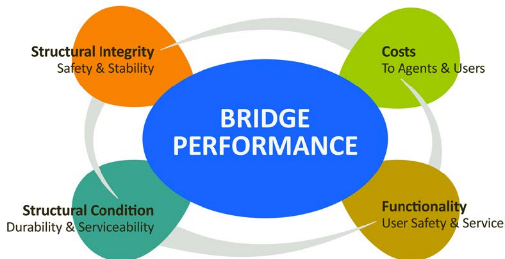
Figure 1. Illustration. Categories of bridge performance issues.

Many of the important parameters that influence these four categories of bridge performance are listed in table 1.