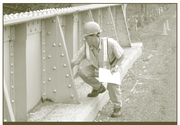
Part of a Routine Inspection at a STAR bridge.

relate with In-Depth Inspection results. In this study, they include factors related to inspector comfort with access equipment and heights, time to complete inspection, structure complexity and accessibility, inspector viewing of welds, flashlight usage, and number of annual bridge inspections. In addition, the overall thoroughness with which inspectors complete inspections tended to have a large effect on the likelihood of defect detection. Not surprisingly, there also appears to be some correlation between the types of defects individual inspectors will note. Specifically, inspectors who find small, detailed defects are more likely to consistently note small, detailed defects regardless of the bridge. Also, inspectors who find gross dimensional defects are more likely to do so on other bridges as well.