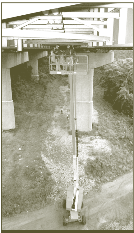
In-Depth Inspection performed with the aid of a lift vehicle. Also note the second observer and inspector performing the Routine Inspector.

tion was collected about these inspectors and the environments in which they worked. This information was then used to study possible relationships of various factors with the inspection results.