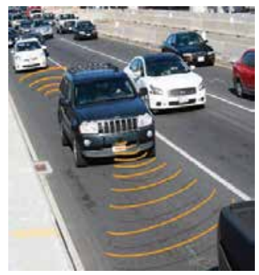
Figure 1. Instrumented research vehicle (IRV) used for data collection.<sup>4</sup>

After analyzing the processed data, strong variations in carfollowing behaviors were observed between work zone and nonwork zone segments.<sup>6</sup> Based on these findings, a car-following model was created that reproduces the unique acceleration patterns, headways, and traveling speeds observed for each segment. The resulting work zone car-following model uses a multi-dimensional psycho-physical framework and acceleration/deceleration algorithms derived from modified field theory to describe carfollowing for freeways, advanced warning, taper zones, and work zones separately.<sup>7,8</sup>