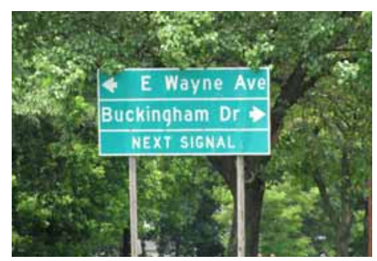
Figure 2. Photo. Example of an advance street name sign.