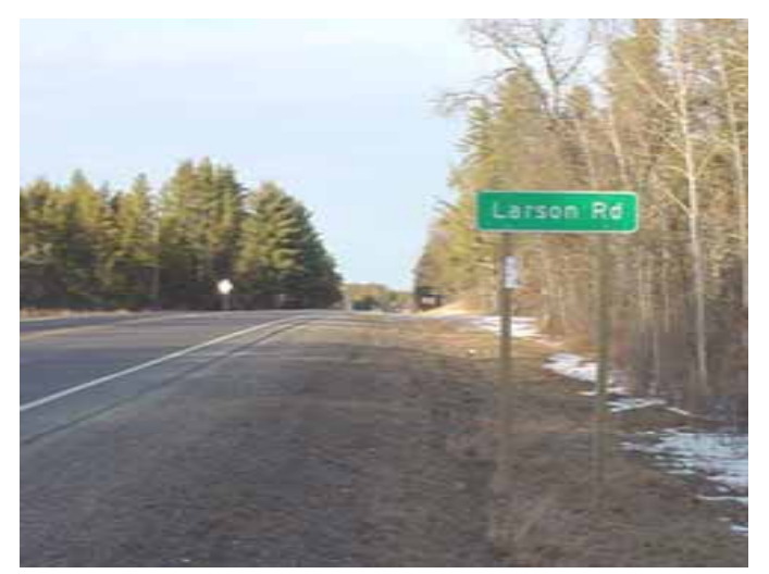
Figure 4. Photo. Example of an advance sign in Wisconsin.