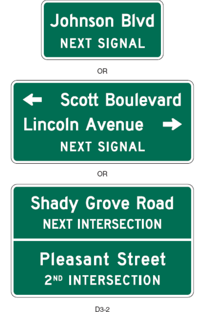
Figure 1. Chart. Advance street name guide signs from MUTCD.