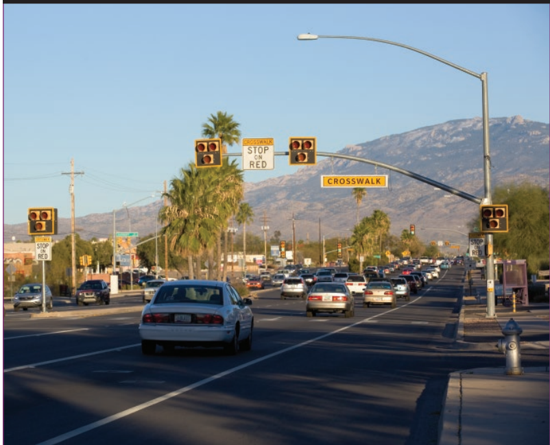
Figure 1. Example of PHB installation in Tucson, AZ.

The pedestrian hybrid beacon (PHB)—or high-intensity activated crosswalk (HAWK), as it is known in Tucson, AZ—is a traffic control device used at pedestrian crossings that was first included in the 2009 Manual on Uniform Traffic Control Devices (MUTCD). (1) The treatment typically has the crosswalk marked on only one of the major road approaches. The PHB's vehicular display faces are generally located on mast arms over the major approaches to an intersection and in some locations on the roadside. An example is shown in figure 1 for an installation in Tucson, AZ. The face of the PHB consists of two red indications above a single yellow indication. It rests in a dark mode, but when it is activated by a pedestrian, it