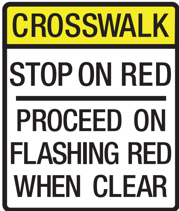
Figure 2. Sign (30 by 36 inches) recommended by FHWA to address comprehension issues with the flashing red phase.

The final dataset reflected over 78 h of video data and included 1,149 PHB actuations and 1,979 pedestrians crossing.