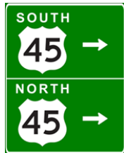
A. Sign set 14.