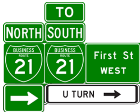
Figure 5. Illustration. Directional assembly for minor approaches that performed the best.