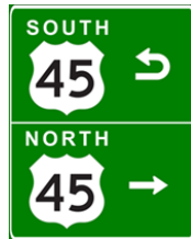
B. Sign set 15.