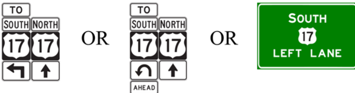
Figure 6. Illustration. Sign sets that performed the best for confirmatory or advance turn signs on a major road in advance of the U-turn lane.

The participants selected their lane choice sooner with any of three sign designs shown in figure 6 (i.e., sign set 24, 25, or 26). There was no difference among these signs, but each did better than no sign at all (i.e., sign set 22) or the route assembly with up arrows under both route markers (i.e., sign set 23).