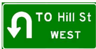
Figure 7. Illustration. Sign set 32 provided a source of confidence as advance route turn on major approach.

Participants chose the option that included the phrase, “I would go straight at this intersection,” more often when an up arrow was used than when the sign showed a U-turn arrow. The state-of-the-practice review showed several States using some variant of an advance turn sign or regulatory turn lane assignment sign with a U-turn hook arrow shape (figure 7). The U-turn hook arrow sign also performed well when tested for the major approach using a video clip in research question 1. The results suggest the U-turn hook assures drivers that they need to stay left. The up arrow does not give assurance that the driver should stay left.