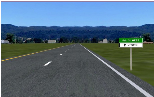
Figure 2. Screenshot. Example still image from video clip.

Videos were used for research questions 1, 2, 6, and 7, and still images were used for research questions 3, 4, 5, and 8, as follows: