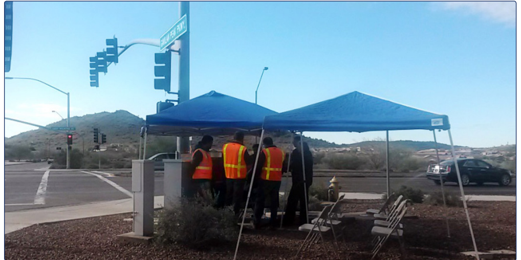
Staff from Maricopa County Department of Transportation's REACT Program at the staging area for the MMITSS field test. REACT staff volunteered as drivers for the field tests.

In support of the evaluation of the U.S. Department of Transportation's (USDOT) Dynamic Mobility Applications (DMA) program, the Federal Highway Administration (FHWA) Office of Operations Research and Development (R&D) oversees the prototype deployment and impacts assessment of the Multimodal Intelligent Traffic Signal Systems (MMITSS). MMITSS is a bundle of applications that seeks "to provide overarching system optimization that accommodates transit and freight signal priority, preemption for emergency vehicles, and pedestrian movements while maximizing overall arterial network performance." 1